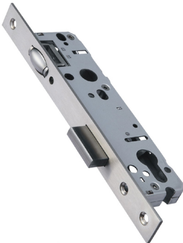
NRL9230EP : 30mm backset Finish: SSS, PSS, PVD, AB