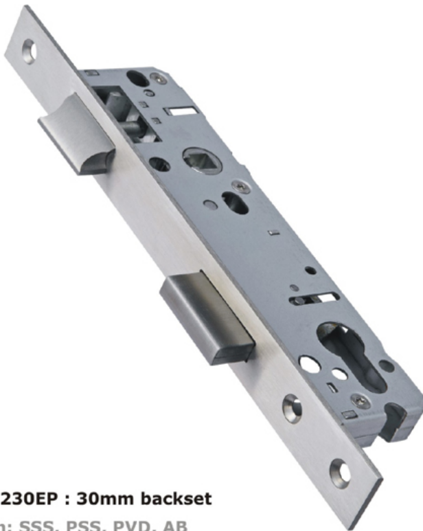
NSL9230EP : 30mm backset Finish: SSS, PSS, PVD, AB