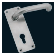
LBS705 22mm Dia Lever Handle on 160 x 60 Back Plate 72mm centre