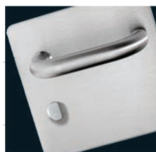
LBS703 - L LBS703 - R Lever on Bathroom Backplate 78mm centre