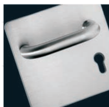
LBS701 Lever Euro Profile Lock Furniture