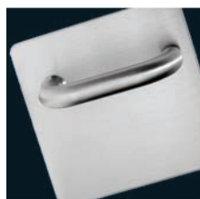
LBS702 Lever Latch Furniture